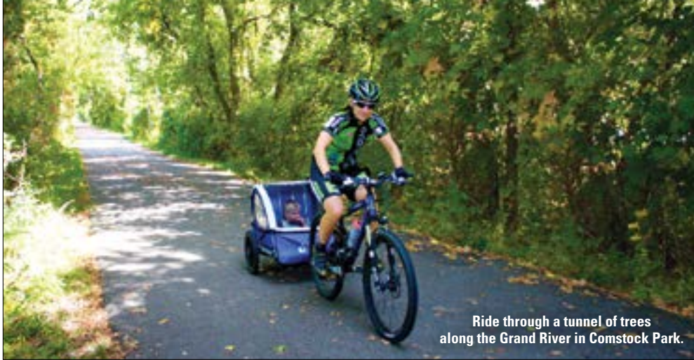
Ride through a tunnel of trees along the Grand River in Comstock Park.