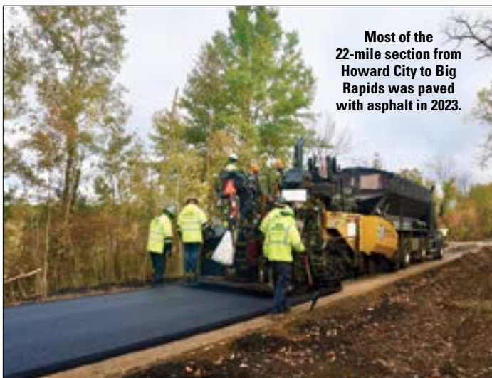
Most of the 22-mile section from Howard City to Big Rapids was paved with asphalt in 2023.

The entire length of trail runs parallel to US-131, providing easy access along its route. And because it was built on an abandoned railroad, the grade is fairly flat and well suited for people of all physical abilities. Each section of trail has its own natural features and unique personality. In the following pages we will introduce you to each section of this magnificent trail.